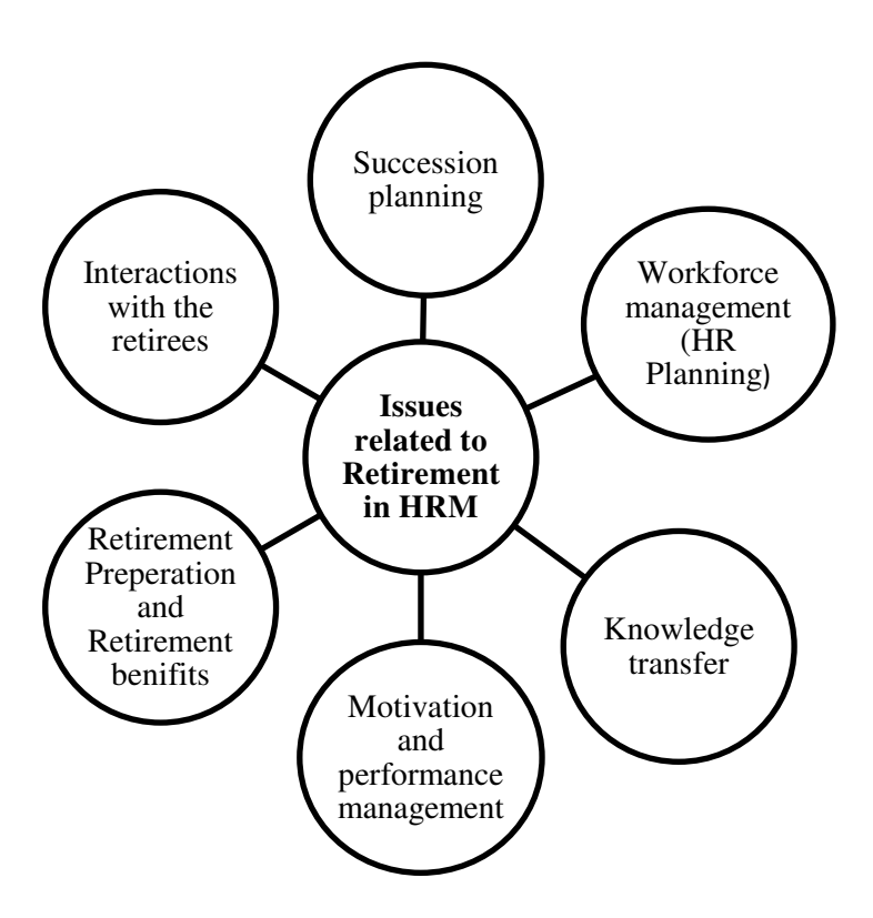
Figure 1- Issues related to retirement considered in HRM